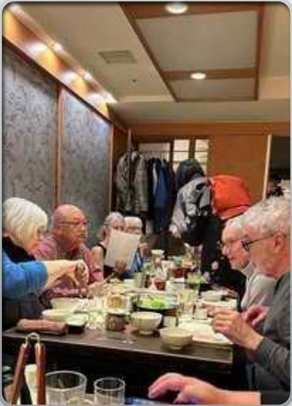
OLLI members enjoying meal in Japan

The work of this committee will be to create additional opportunities for our curriculum and our membership to reflect diverse cultures, backgrounds, experiences, and learning styles in alignment with DU and Osher Lifelong Learning National Resource Center.